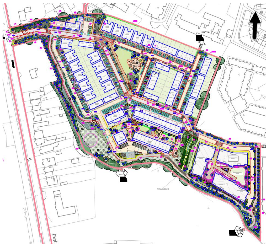
Figure 2 – Overall Pedestrian Connectivity

Additional pedestrian connectivity proposals are also outlined in the application to adjoining estate of Millwood to the north and also possible future connectivity to the adjoining school campus. See figure 2 below which shows the pedestrian connectivity proposals.